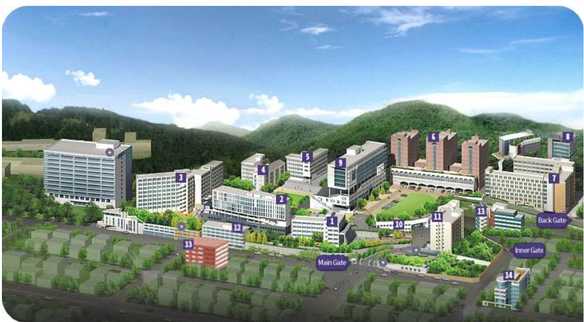
1. Administration Office 2. Nan-Hyang Building 3. Plastic Arts Building 1 4. Plastic Arts Building 2 5. Music Hall 6. Sujung Building 7. Science

Building 8, Prime Hall 9, Sungshin Building 10, Sports Complex 11, Central Library 12, Student Center 13, Dormitory 14, Media & Information Building