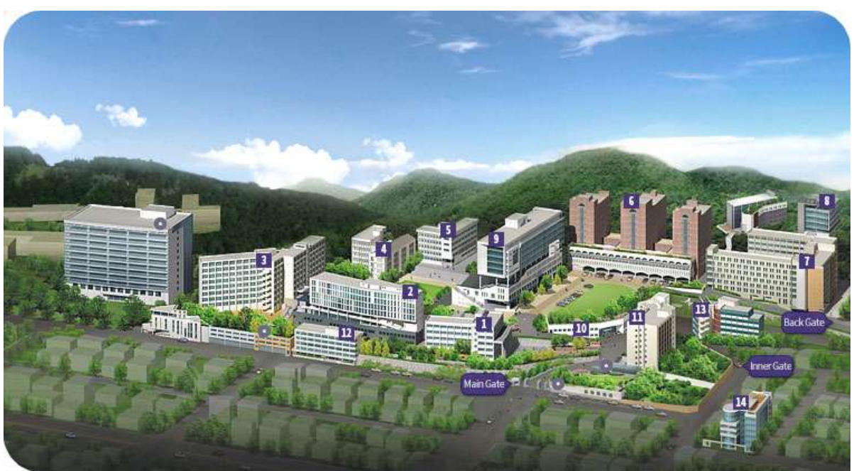
1. Administration Office 2, Nan-Hyang Building 3, Plastic Arts Building 1 4, Plastic Arts Building 2 5, Music Hall 6, Sujung Building 7, Science Building 8, Prime Hall 9, Sungshin Building 10, Sports Complex 11, Central Library 12, Student Center 13, Dormitory 14, Media & Information Building