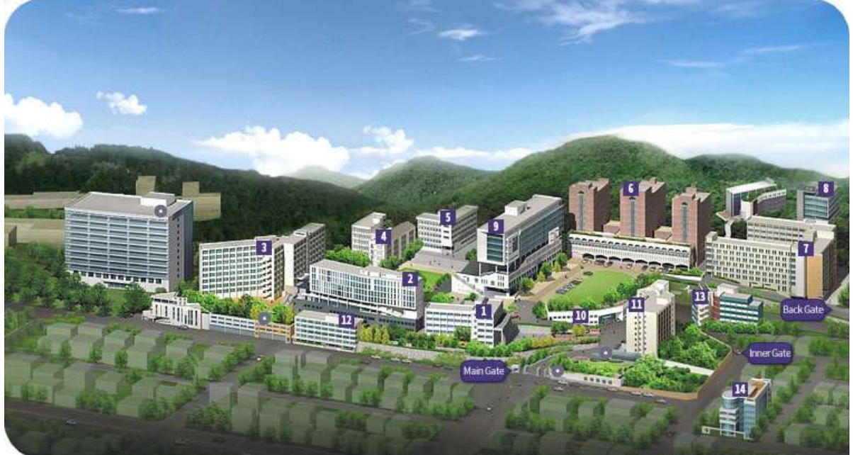
Administration Office Nan-Hyang Building Plastic Arts Building 4. Plastic Arts Building 5. Music Hall 6. Sujung Building 7. Prime Hall 8. Hyunjung Patriotic Building 9. Sungshin Building 10. Sports Complex 11. Central Library 12. Student Center 13. Dormitory 14. Media & Information Building