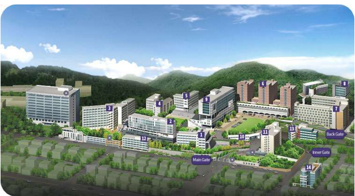
1. Administration Office 2, Nan-Hyang Building 3, Plastic Arts Building 1 4, Plastic Arts Building 2 5, Music Hall 6, Sujung Building 7, Science Building 8, Prime Hall 9, Sungshin Building 10, Sports Complex 11, Central Library 12, Student Center 13, Dormitory 14, Media & Information Building